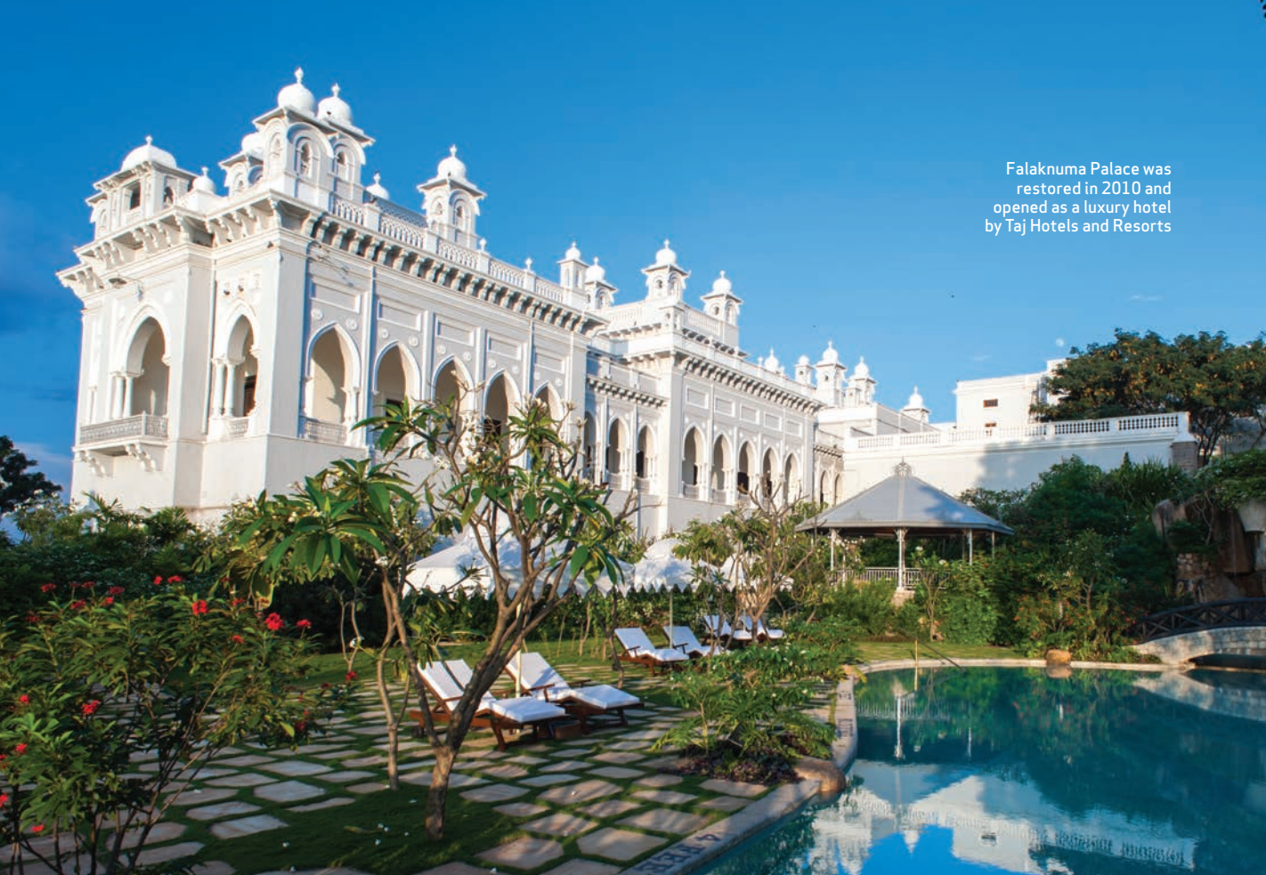
Falaknuma Palace was restored in 2010 and opened as a luxury hotel by Taj Hotels and Resorts