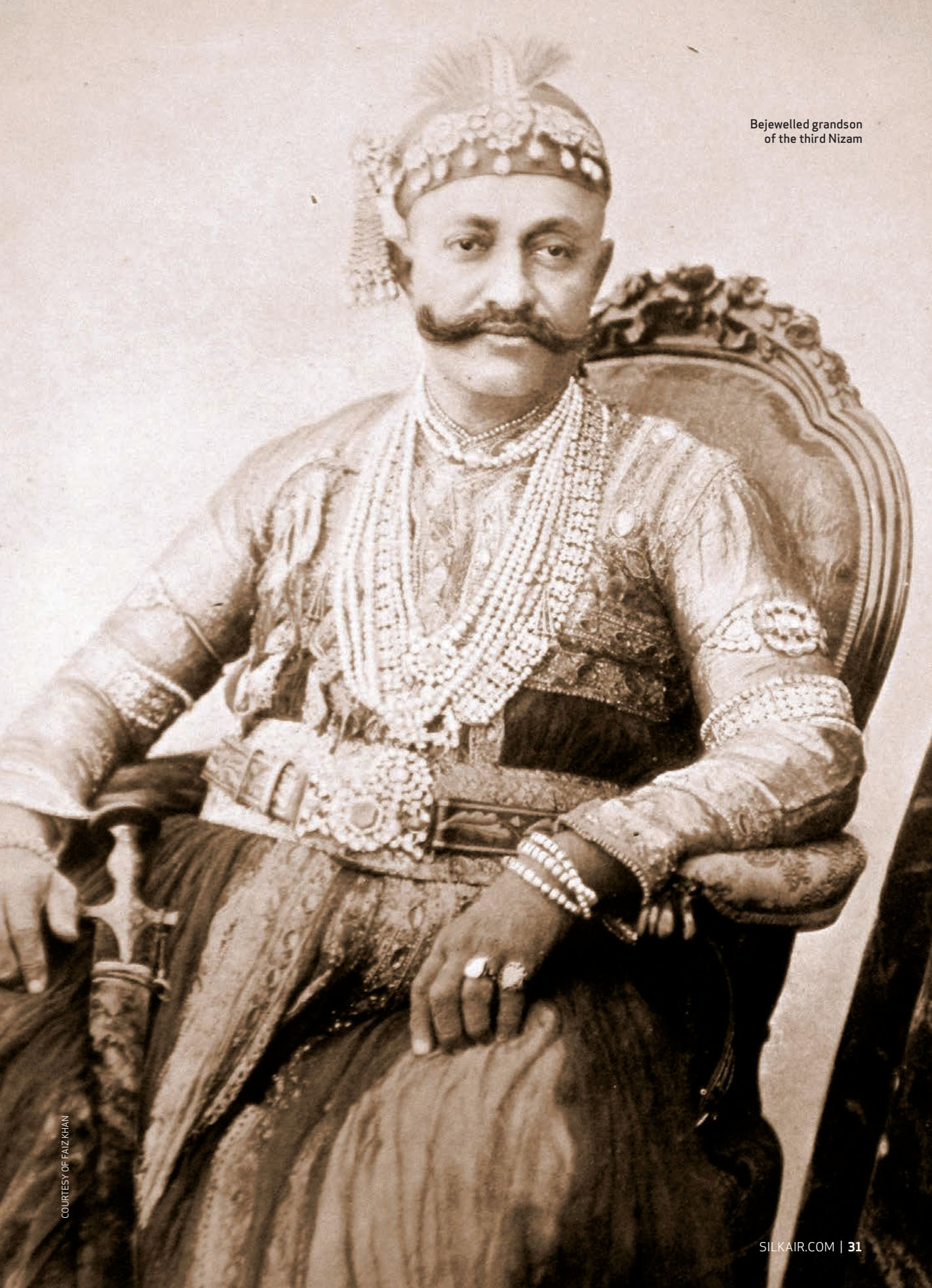
Bejewelled grandson of the third Nizam